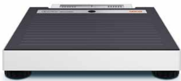
The flat construction and non-slip tread make it stable and comfortable to step onto.

A good name is earned through quality and modern functionality. That is why the seca 878 dr has been labelled the "doctor scale". It indicates the value of the product while reflecting the professionalism of the user. The label gives users certainty about the precision of the measured values and can be personalised. Further information can be found at www.seca.com/doctorscale .