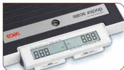
The two buttons on the front side of the scale can be easily operated by foot.

You can also access the website via this QR code: