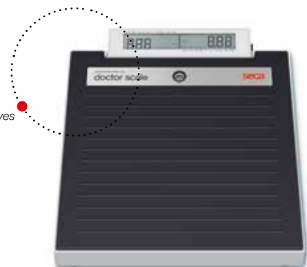
The custom label serves to provide individual personalisation.